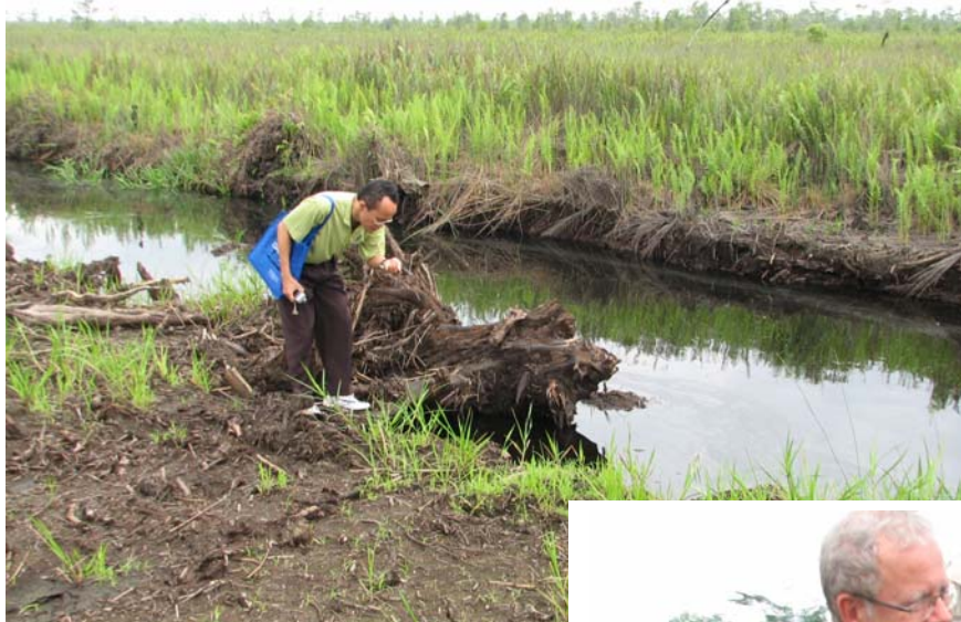
A drainage channel in deforested peat areas

Only a few farmers were successful in producing agricultural crops in the peat areas, like the farmer shown on the photo. He applies ash and mineral fertilizer to produce maize and vegetables. Prof. Bähr is seen in conversation with the farmer.